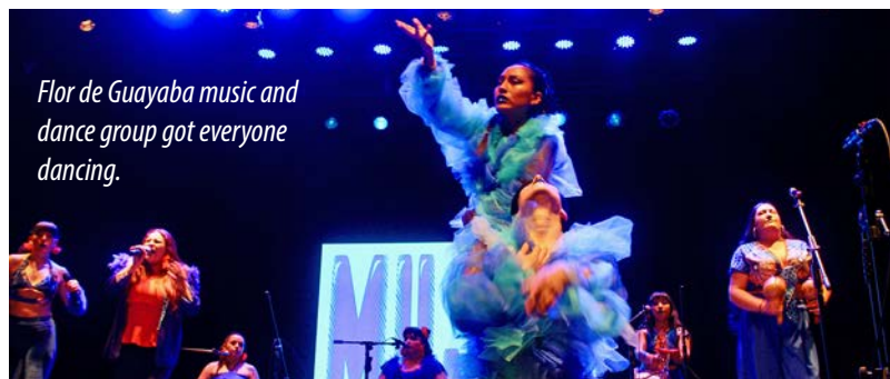
Flor de Guayaba music and dance group got everyone dancing.