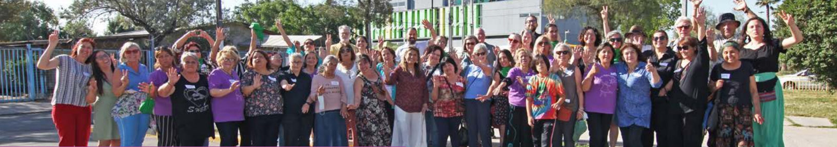
Outside the Auco Community Center and garden in El Bosque on Nov. 21 following the testimonies of health promoters and the collaborative presentations between health groups and the international delegation.

In Concepción, EPES team members led by Dr. Lautaro Lopez made a presentation on the geography, history, culture, politics and economics of the Biobío region. The top issues affecting the population were shared, including earthquakes, industrial pollution, unemployment, poverty, and mental health—all problems exacerbated by the pandemic.