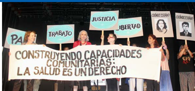
Founding team with 1980s banner Building community capacity: Health is a Right

An especially energetic greeting came from a delegation from the Las Cañas Community Center in Valparaíso, also graduates of EPES International Training Program, which made gala of their street theater programs to get the crowd dancing and clapping.