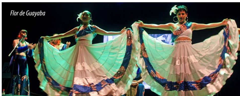
Flor de Guayaba