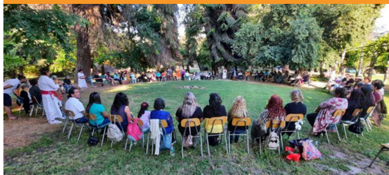
Gathering to give thanks for EPES' 40 years of work for justice, health and dignity.

In addition to a showcase highlighting decades of work from Santiago-based health groups, the delegation viewed murals made by the Llaleta group in the community of San Ramón. Images of smiling Chileans with raised fists and missing eyes provided a bittersweet reminder of the courage and sacrifices that manifested during the social uprising that led to Chile's unsuccessful constitutional reform effort, in which over 400 people lost all or part of their sight, deliberately targeted by police rubber bullets.