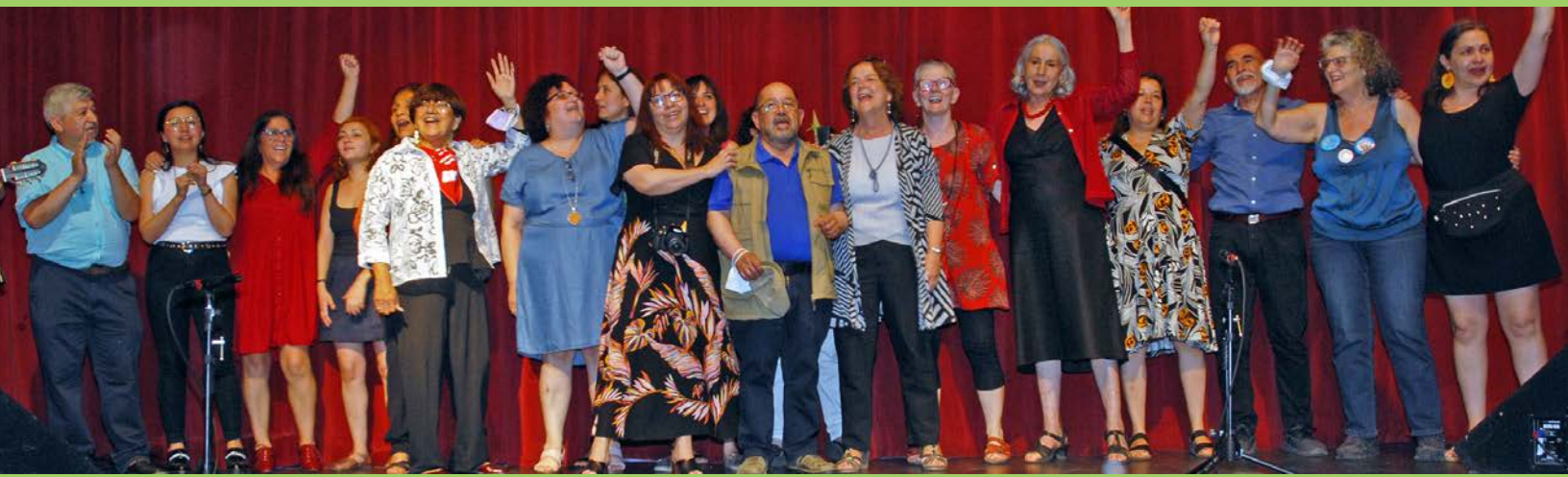
EPES staff on stage closing the anniversary celebration enthusiastically singing with the audience Victor Jara's song, "The Right to Live in Peace."

With Chile at a crossroads, EPES celebrated 40 years of radical hope and solidarity for enduring change. This vision was renewed as companions spanning generations, borders, professions and faiths shared their songs and stories, recounted their struggles, and nourished their spirits with gratitude and love.