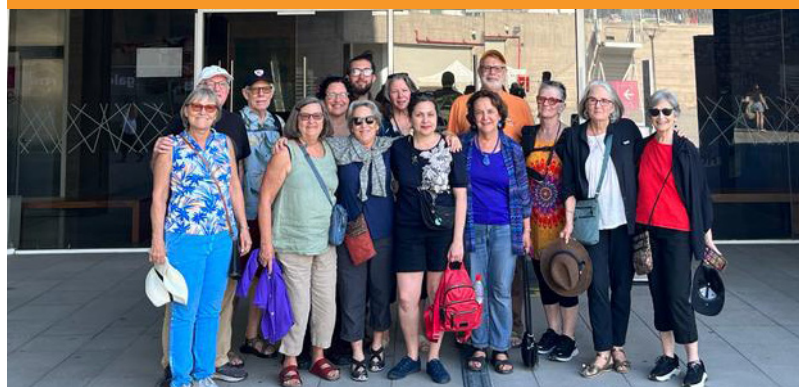
International delegation visiting Chile's Museum of Memory and Human Rights.