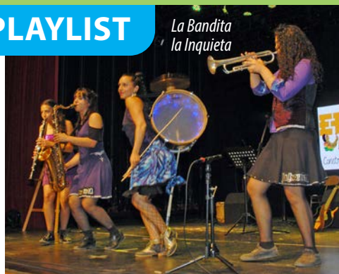
La Bandita la Inquieta