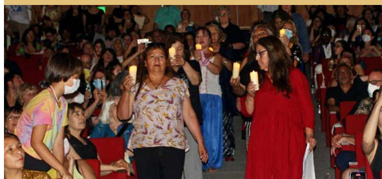
Recalling the 1990s Candlelight Memorials held every May to remember lives lost to AIDS, health promoters and EPES staff enter with candles and singing.