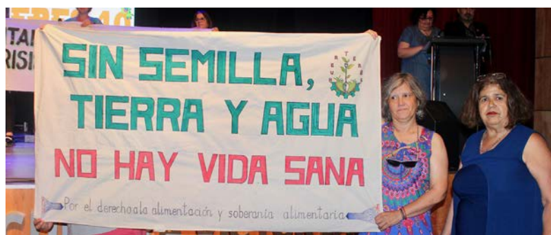
Greeting from the Huerteras (community gardeners): Without seeds, land and water there is no healthy life.