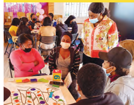
Immigrants in El Bosque play games and discuss topics such as reproductive rights.