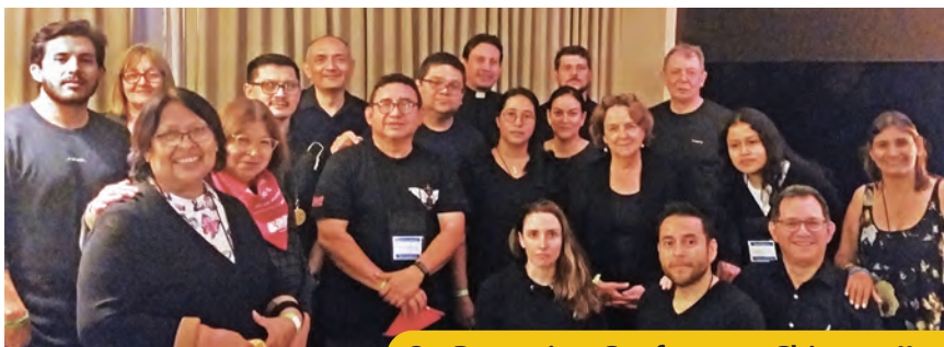
On Becoming Conference, Chicago, IL

The Latin American and Caribbean team at the On Becoming conference wore black on Thursday in keeping with #ThursdaysInBlack campaign, a global movement resisting attitudes and practices that permit rape and violence.