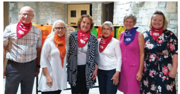
Trinity Lutheran Church, Owatonna, MN