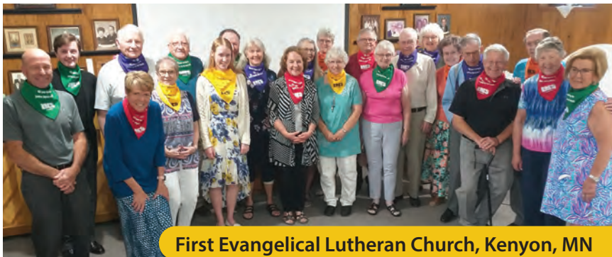
First Evangelical Lutheran Church, Kenyon, MN