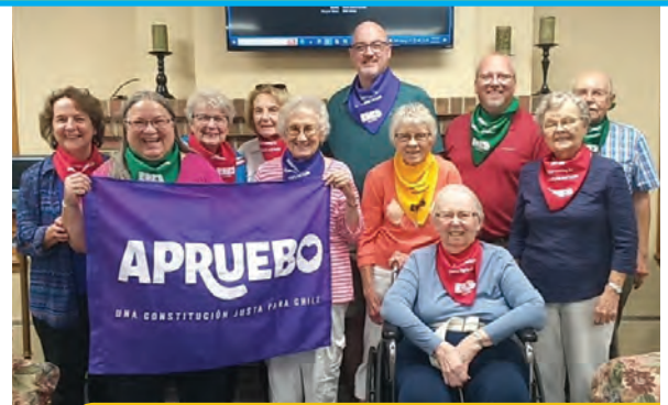
St. John's Lutheran Church, Kasson, MN