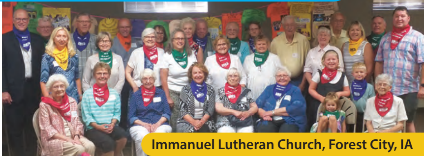
Immanuel Lutheran Church, Forest City, IA