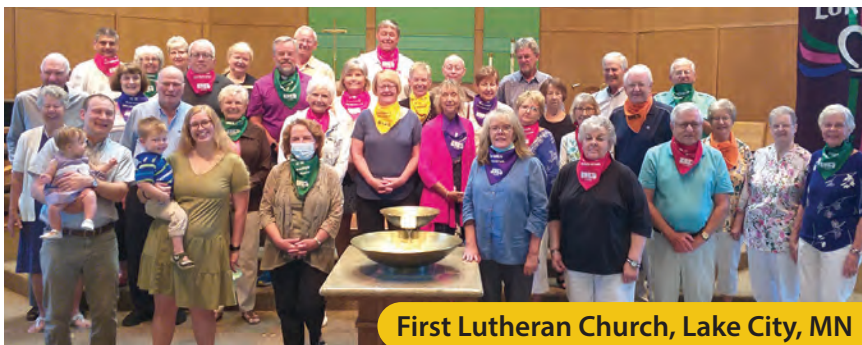
First Lutheran Church, Lake City, MN