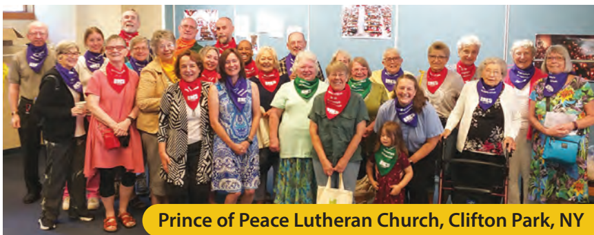
Prince of Peace Lutheran Church, Clifton Park, NY