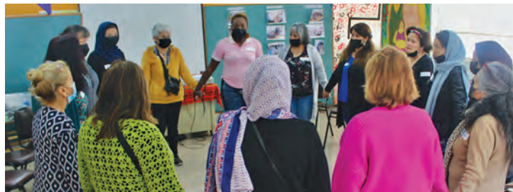
Workshops offer women emotional support in Santiago and Concepción.