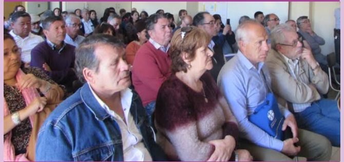
Leaders and neighbors of different municipalities of Concepción took part in the forum with the Argentine Nobel Peace Prize laureate.