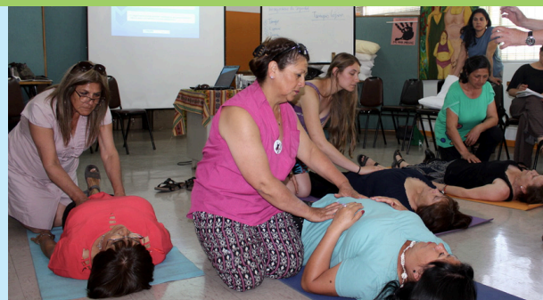
Health promoters putting into practice relaxation exercises learned during the Psychological First Aid workshop.

The 20-hour course, held in two full days, equipped participants with theoretical and practical tools that draw from popular education methods and principles. The focus on rights and social determinants of health will foster their work with the local community and with other sectors of society.