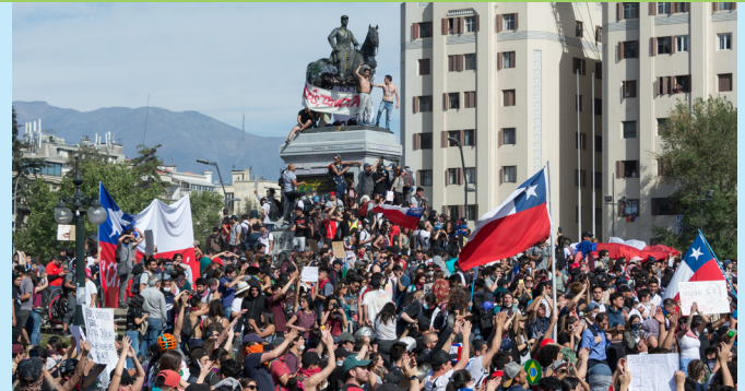
Protesters in Plaza Baquedano, downtown Santiago, Chile, October 22, 2019

What does this mean for EPES? Although many aspects of "normal" life have been altered, our work continues with community health teams, immigrant communities, as well as national networks working for Health for All and to end violence against women. We have helped organize local assemblies, our centers provide a meeting space for many organizations, and we have hosted seminars with experts to understand what is happening. We have also organized stress management sessions for the health teams and staff, many of whom are feeling retraumatized by the militarized atmosphere and systematic violation of human rights.