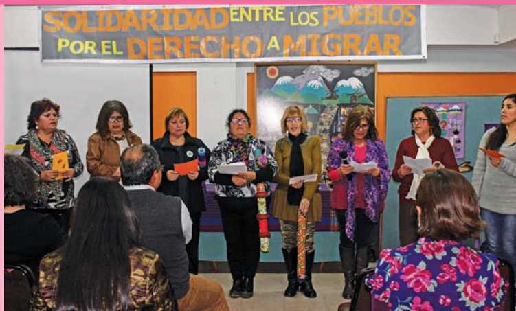
Eighty people gathered in September at EPES to discuss immigrant rights. A woman from Haiti speaks to the group in her native Creole about the challenges they face as immigrants.