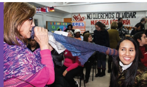
Health promoters used whispering tubes to transmit messages into the ears of forum participants.