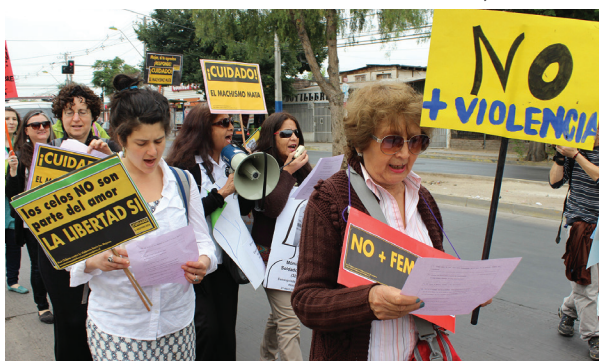
The march for women's right to violence-free lives on the International Day for the Elimination of Violence against Women.

of the third local Writing Competition on Women's Stories "When we stop shouting in silence," convened by the local Network for No Violence to Women. The writing competition is part of a series of diverse actions to raise public awareness on the issue of violence against women.